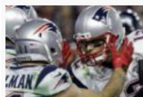
Patriots' Super Bowl win will haunt Seahawks: Arthur

Toronto winter storm continues to blast into Monday morning