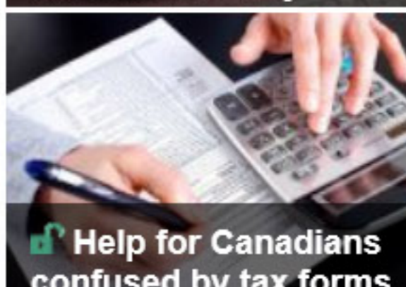
Help for Canadians confused by tax forms