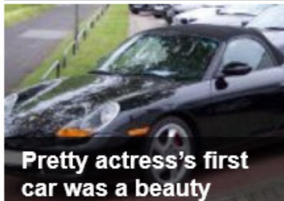
Pretty actress's first car was a beauty