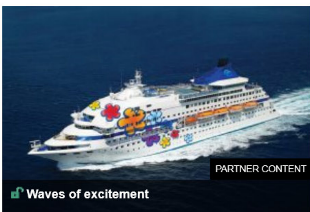
Waves of excitement