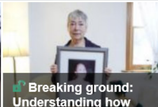
Breaking ground: Understanding how